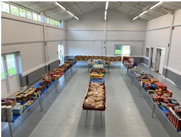
The newly deep cleaned and decorated community centre hall – temporary home to the Hartwell Food Bank