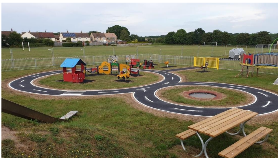
Part of the new playground at Hartwell Community Centre

The biggest change however was the installation of the new playground. We won't dwell too much on this in this article as we plan to write a dedicated piece thanking those that made the playground happen. Keep an eye out for this next year, along with a formal opening ceremony!