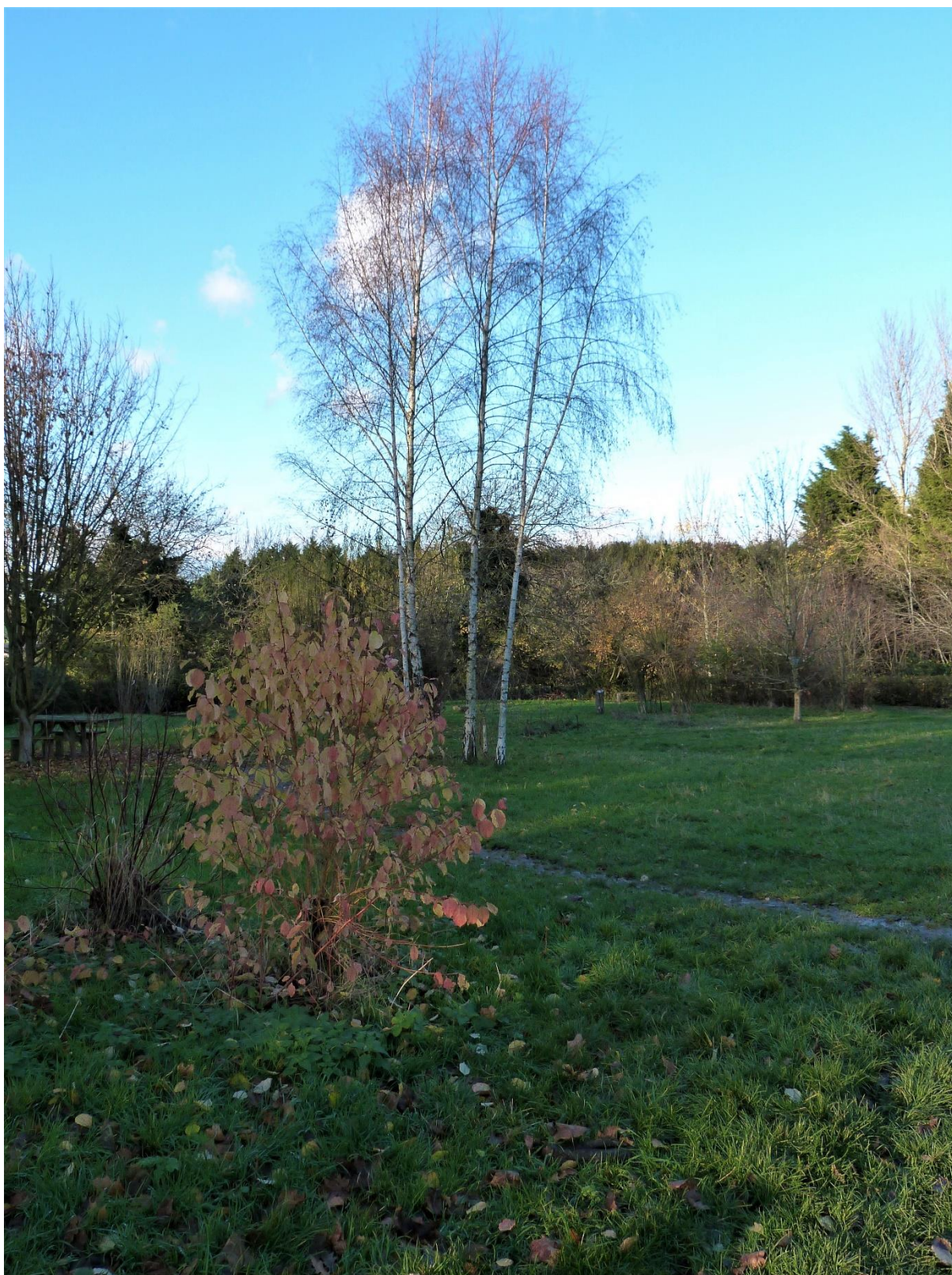
Hartwell Pocket Park – November afternoon